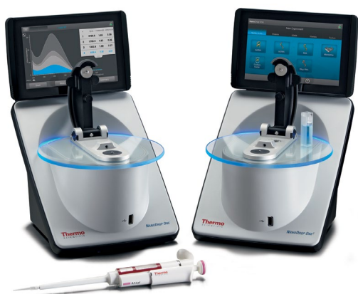
Thermo Scientific NanoDrop One/One ® Microvolume UV-Vis Spectrophotometer